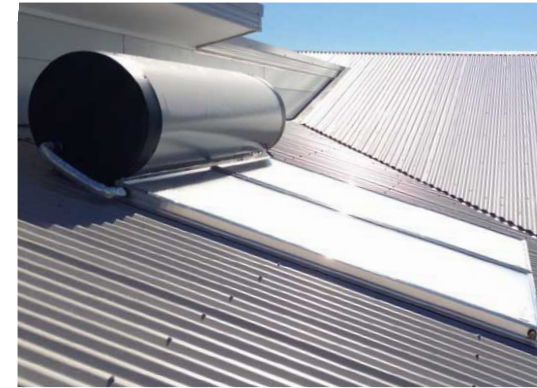
Solar Water Heating