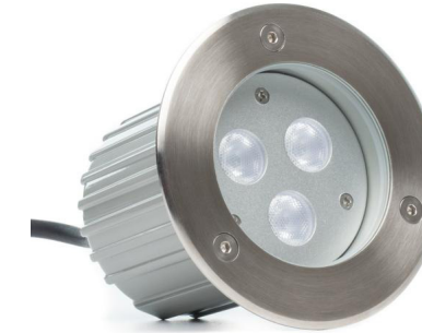
Energy Efficient LED Lighting