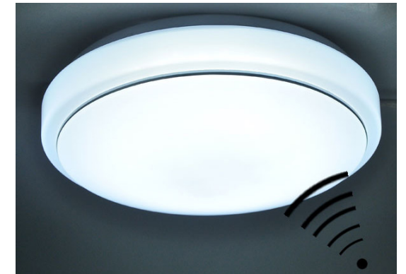
Motion Sensing Lighting